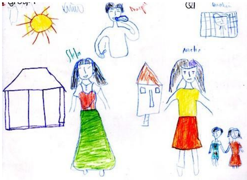
Sketch #1. By Liza and Fe, 24 and 32 years, respectively, Boracay Island.

Liza and Fe, 24 and 32 years, respectively, and both married women from Boracay Island, provided the following narrative along with their sketch (Sketch #1).