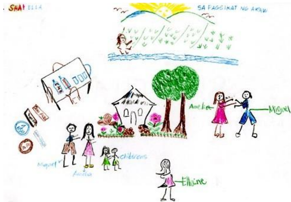
Sketch #2. By Sha and Ella, 29 and 23 years, respectively, Boracay Island.

Sha and Ella, 29 and 23 year old women residents of Boracay, drew the following sketch (Sketch #2), and noted: