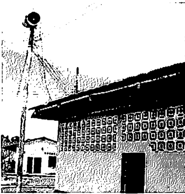
The community loudspeaker in san Francisco to amplify radio broadcasts and more