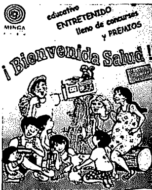
A poster promoting Bienvenida Salud !

Bienvenida Salud is a half-hour radio program broadcast three times a week (Monday, Wednesday and Friday) at 5:30 a.m. – the time when people are waking up in the Amazonas, and then repeated the same days in the evening. Bienvenida Salud is purposely designed to both entertain and educate to increase audience members' knowledge about reproductive health, sexual rights, and gender equality, creating favorable attitudes, shifting social norms, and changing overt behavior. 10 By mid-2008, Minga Perú had broadcast over 1,100 episodes of Bienvenida Salud , earning audience ratings of about 40 to between 45 to 50 percent among radio-owning households in the rural area of the Loreto Region. Each show is taped and sent