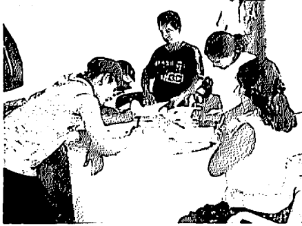
Radio correspondents undergoing training in writing letters to the radio program

Building on these discussions, the participating teachers developed educative projects to be integrated in 10 subject areas of the school curricula, covering students in all five secondary grades. 9